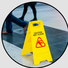
Slip & Falls