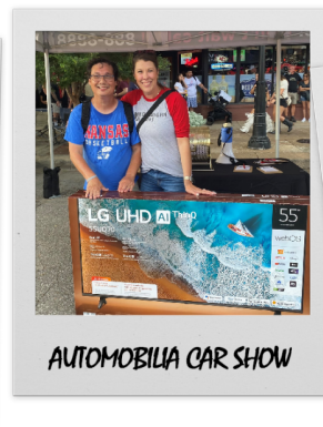
AUTOMOBILIA CAR SHOW