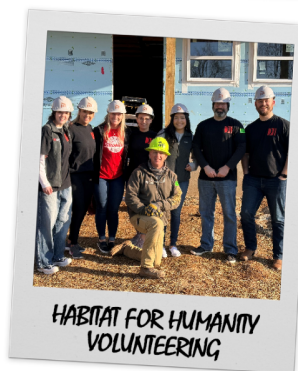
HABITAT FOR HUMANITY VOLUNTEERING