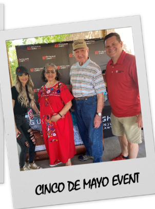
CINCO DE MAYO EVENT