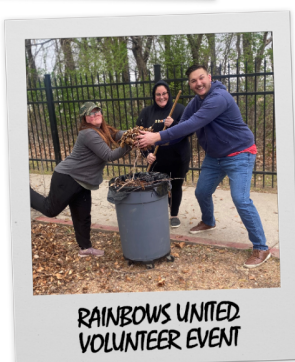
RAINBOWS UNITED VOLUNTEER EVENT